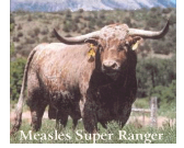
MEASLES' SUPER RANGER